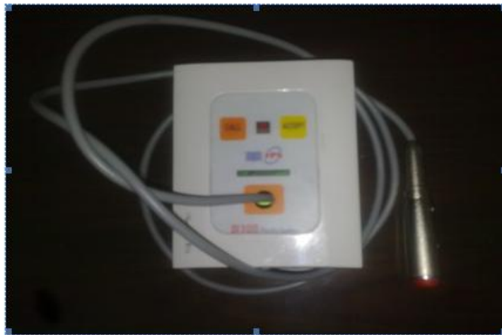
Electronic Touch Pad

Power Button: Pressing this for long time (approximately 3 sec) turns the device ON or OFF.